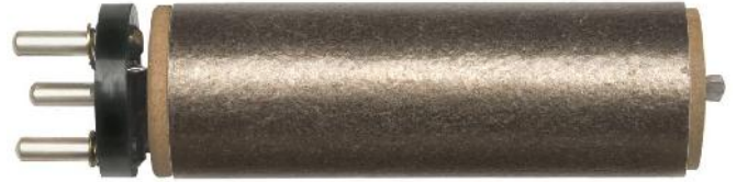
FORSTHOFF, 230 1 500 ( . F2007).