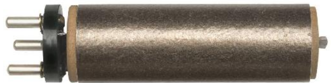
FORSTHOFF, 230 1 500 ( . F2007).